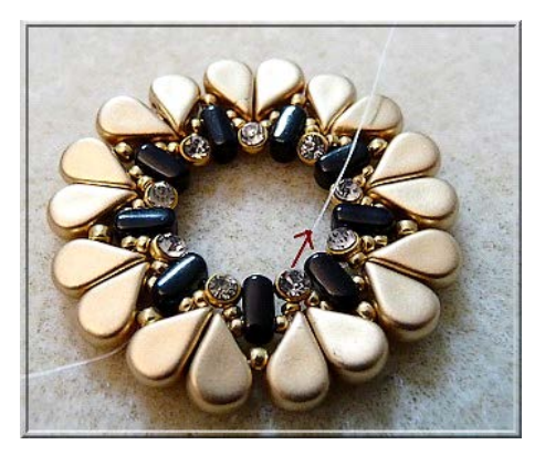
7) Pass through MR (top hole).