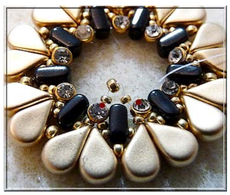
8) Between each RM add 1 SB15, 1 SB11, 1 SB15, above the IOS.