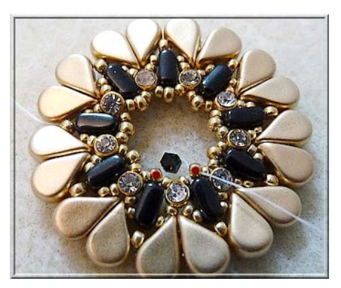
10) Between each SB11, add 1 B3.