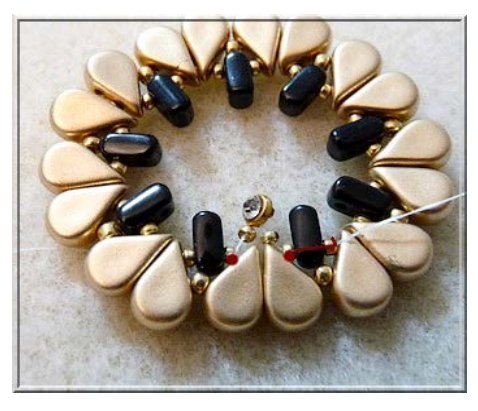
5) Between the SB15, add 1 SB15, 1 MR and 1 SB15. Repeat until you complete the row.