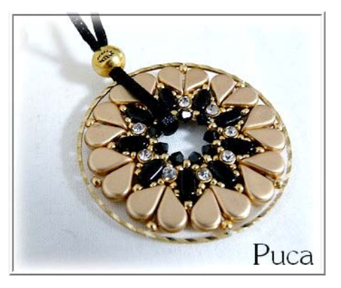
With a silk cord and a metal bead: Originality ©

Happy beading! Thank you for respecting my work. Puca on November 20, 2017