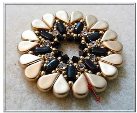
11) Pass through the beads and go out through Amos (middle of the heart, top hole).