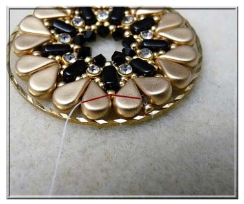
14) Pass through Amos (top hole), the SB11 and the second Amos (top hole). Repeat the step 13 until the end of the row.