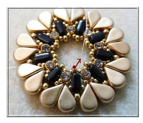
9) Pass through SB11 (middle).