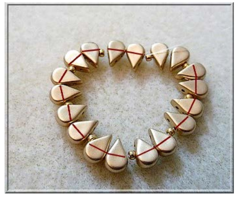
1) Pick up 2 Amos (top hole) + 1 SB11. Repeat until you have 9 pairs of Amos and close.