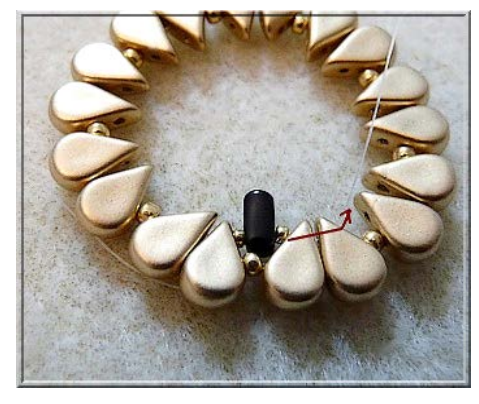
3) Pick up 1 SB15, 1 IOS, 1 SB15 and pass through the 2 Amos. Repeat until you complete the row.