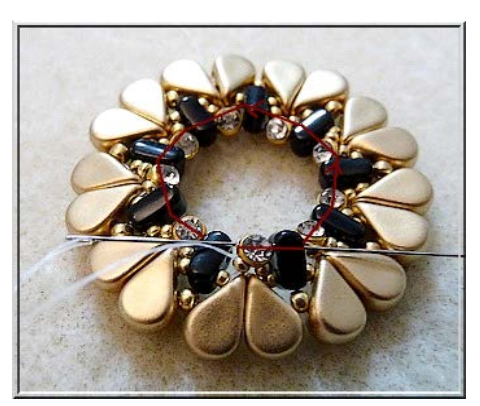
6) Exit from MR (top hole) and pass through IOS (top hole). Repeat until you complete the row. This pulls the beads together nicely.