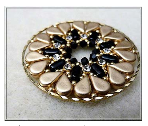
15) You can finish your pendant in this way or you can add 2 Brick Stich rows.