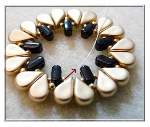
4) You will have this © Exit from SB15.