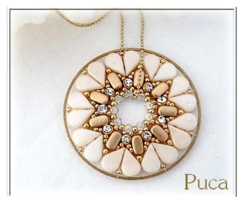
A simple little ball chain: Finesse and brightness guaranteed ©