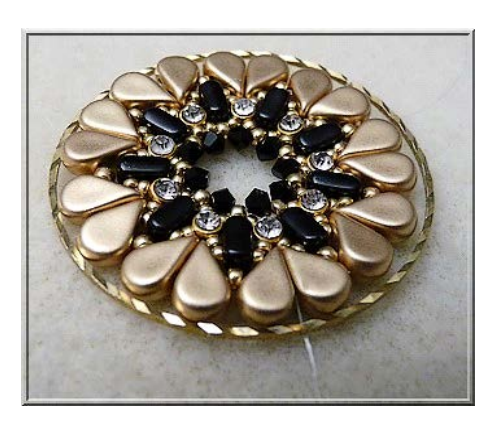
12) Place the ring.